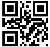
BioHub Unlock Usage Rates